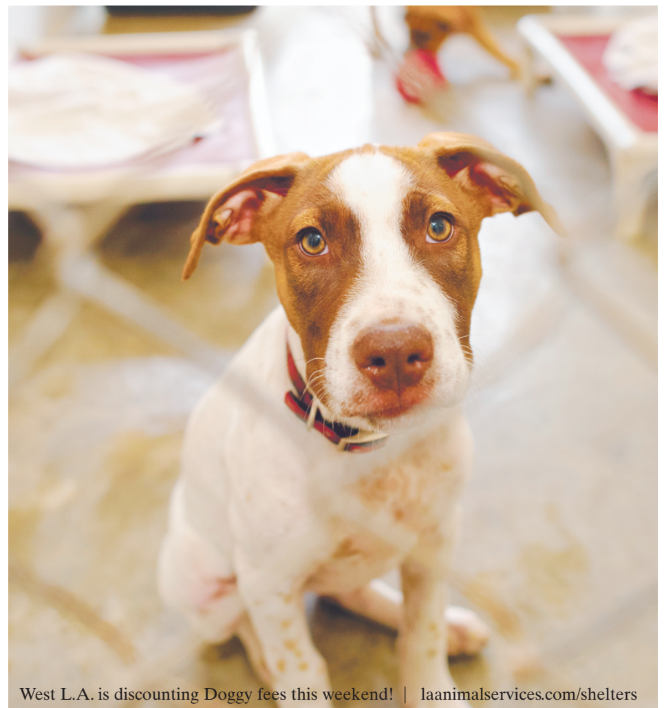
West L.A. is discounting Doggy fees this weekend! | laanimalservices.com/shelters

During the day, the West L.A. Animal Shelter is run for a large part by volunteers. If you want to be part of the shelter, you have to bring identification that says you're at least 16 years old (if it's obvious that you're a young person.)